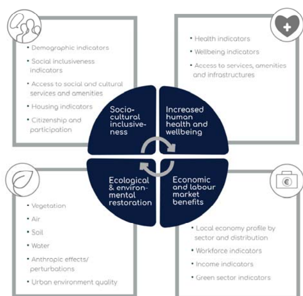
Figure 1 – The four assessment domains of WP4

The NBS that will be implemented in the four Front Running Cities (FRC) of proGReg are productive Green Infrastructures (GI) and they will be realized in post-industrial sites with the aim of achieving a number of benefits, classified according to four domains, corresponding to the first four Tasks of the WP4 (Fig.1): Task 4.1 – Socio-cultural inclusiveness; Task 4.2 – Increased human health and wellbeing; Task 4.3 – Ecological and environmental restoration; and Task 4.4 – Economic and labour market benefits. For each one of the proposed assessment domains, specific indicators describing the associated benefits will be quantified.